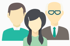
Citizens, Residents, Businesses, Foreigners