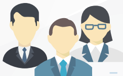
Agency admin, Back-officers, Front-officers, Government representatives